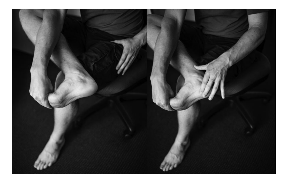
Fig. 1. Plantar-specific stretching was performed with the patient crossing the affected leg over the contra lateral leg. While placing the fingers across the base of the toes, the patient pulled the toes back toward the shin until they felt a stretch in the arch or plantar fascia. The patients were instructed to use their other hand to palpate the tension in the plantar fascia to confirm the stretch.