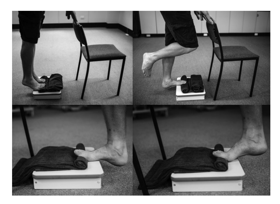
Fig. 2. Unilateral heel raises were performed with a towel under the toes to increase dorsal flexion of the toes during heel raises.

bilateral pain, they were instructed to perform the high-load strength training with both limbs.